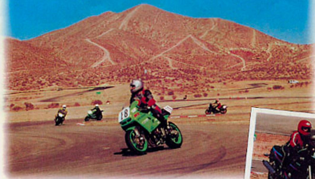
Motorcyclists learn fine art of cornering a two-day weekend course at the California Superbike School.